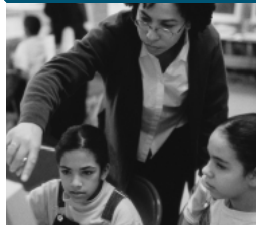
Cisco GLN goes well beyond past solutions.